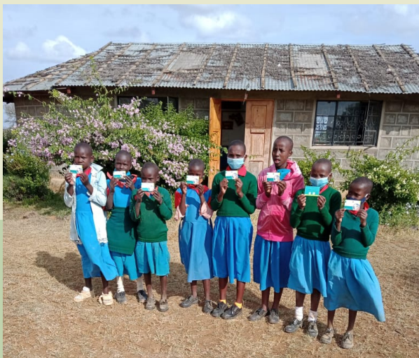
Reusable menstrual pads donated to girls of Mugie School

Please read on to learn about our projects and their impact, the challenges we have faced, and our goals for next year. This is an exciting moment for Moyo, and we're glad to have you bear witness.